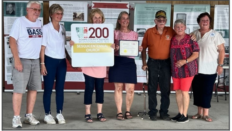
St. Anthony of Padua Church was recognized by the County of Adams for serving the community for 150 years at the Adams County Fair.

Opportunity to Volunteer & Participate Quincy SPIRIT (Special People In Religious Instruction Today) is reaching out to see if anyone is interested in becoming a volunteer with the Quincy Spirit group. Come be a part of a rewarding experience. We also want to extend an invitation to any person with special needs in our community who