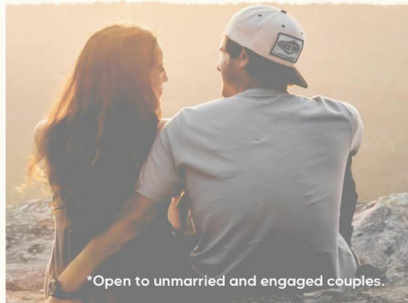
*Open to unmarried and engaged couples.

Mid-life Singles: Are you looking for a renewed sense of purpose & belonging? Register today for a life-changing REFLECT weekend retreat at the Pallottine Renewal Center, Florissant, MO (30 min from downtown St. Louis), on August 15-17, 2025. Take a chance and get involved... you won't regret it! Cost is $290 including meals. Visit www.ReflectRetreat.com , e-mail reflect.stlouis@gmail.com , or call (630) 222-8303 for details.