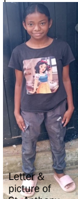
Letter & picture of St. Anthony Unbound Sponsor Child