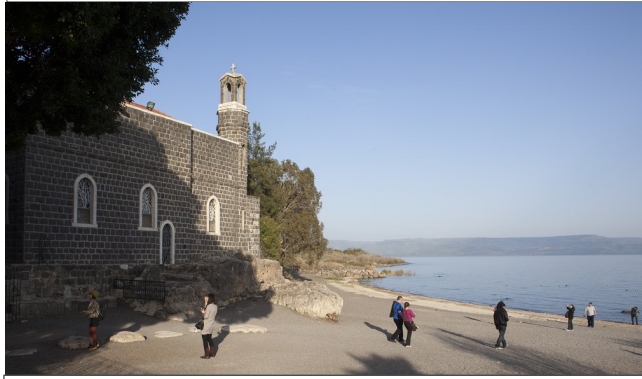
Church of the Primacy of St. Peter, on the shore of the Sea of Galilee, Tabgha, Israel

Jesus says. "Thus it is written that the Christ would suffer and rise from the dead on the third day and that repentance, for the forgiveness of sins, would be preached in his name to all nations, beginning in Jerusalem. You are witnesses of these things." (Luke 2: 45-48)