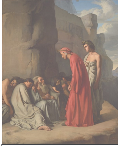
Dante offers consolation to souls condemned for envy, Hippolyte Flandrin (1809-1864)

Envy is one of those sins that we all know, but perhaps can't really explain well. Most will say that envy has to deal with wanting and desiring a good that belongs to another. "I want to drive a car like that." "I wish I had a job that paid that kind of salary." But envy is not limited to worldly goods— one can be envious of talents, of relationships, of wealth, of virtue... of any human quality of excellence. Ultimately envy is different than jealousy. Jealousy is the raw desire for the goods belonging to another. Envy takes it one step further. Envy takes sadness in the lack of that good and the holding of that good by another. This is truly demonic, as when one is envious, one chooses not to 'count their blessings' but to 'count someone else's blessings' and make a judgement against God's generosity and mercy.