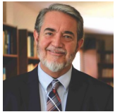
Keynote: Dr. Scott Hahn

The Diocesan Eucharistic Congress will include nationally recognized Catholic speakers, adoration, confession, and Mass. For details, speaker bios, and schedule-visit dio.org/revival-bos .