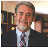
Keynote: Dr. Scott Hahn

The Diocesan Eucharistic Congress will include nationally recognized Catholic speakers, adoration, confession, and Mass. For details, speaker bios, and schedule-visit dio.org/revival-bos .