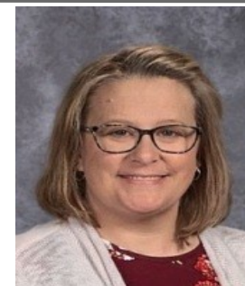
Mollie Ozment Kindergarten