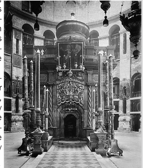
The 'Edicule' ('little house') standing over the site of Jesus' tomb in Jerusalem, inside the Church of the Holy Sepulcher.