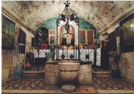
Jacob's well, housed in the Orthodox church of St. Photinus in the modern city of Nablus in Israel.

The next three weekends of Lent, we hear a series of stories from the Gospel of John. The First story is the Samaritan Woman at the Well. She was searching not only for some water, but for some clarity in her life. She had been married a number of times, but had not found a stable relationship in her life. Jesus approaches her as a supernatural suitor, one who is vying not simply for her affections, but for a supernatural love which she herself was perhaps not aware of.