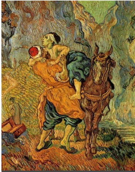
The Wounded Hero by Vincent Van Gogh

mercy presumes compassion , that is, the willingness to embrace the brokenness of others.