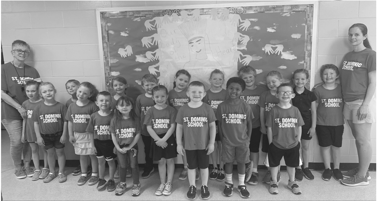
Kindergarten Leaders—Our Lady with the Golden Heart