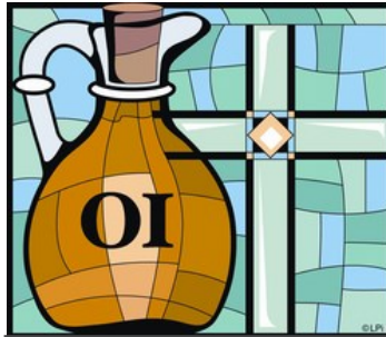
“OI” seen on ampules and oil stocks stands for olea infirmorum, or simply “oil for the sick”

— Parish Office Hours — Monday-Friday 8:00 a.m.-Noon Bulletin Deadline: Monday, Noon