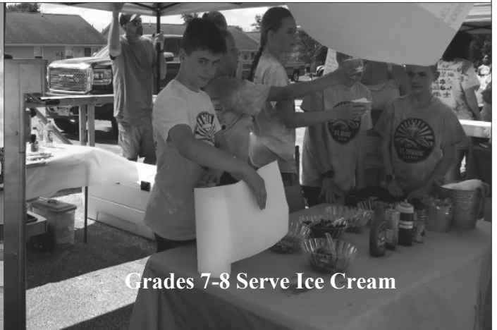
Grades 7-8 Serve Ice Cream