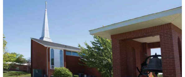
ST. ANTHONY OF PADUA CATHOLIC CHURCH