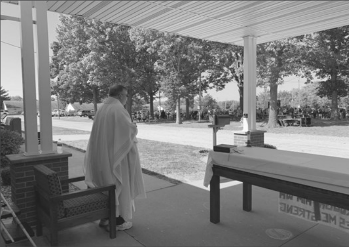
Eighth Grade Holy Heroes

On Wednesday, October 7th, St. Dominic School celebrated Grandparent’s Day 2020 with a lovely afternoon Mass on the Grass. After enjoying the presence of Jesus during the Liturgy of the Word and Liturgy of the Eucharist, we also sang “Angels Among Us” during Mass. We recognize the amazing love God has shared with us by giving us our grandparents. The song lyrics express our appreciation ... “Oh, I believe there are Angels Among Us, Sent down to us from somewhere up above. They come to you and me in our darkest hours, To show us how to live, To teach us how to give, To guide us with a light of love.” Following the Mass, students gave their grandparents a card to show their love and appreciation for them, along with an article about Jesus’ grandparents. Several grandparents and family members shared their appreciation for providing an outdoor opportunity to attend mass, especially with their grandchildren. Some of them felt so blessed because it was the first time they had received communion since March because they watch mass on TV. When we receive Jesus in Holy Eucharist it is an amazing Holy Moment!