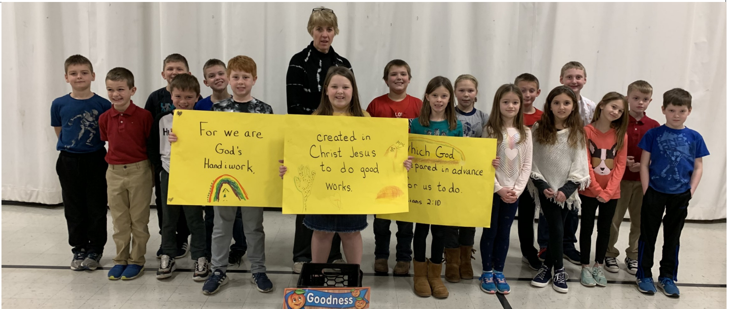
Good Works—Buddies Make Valentines for Vets

Protect me, Holy Spirit, that I may always be holy.